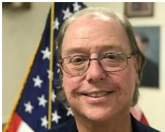
Worthy Brother Knights